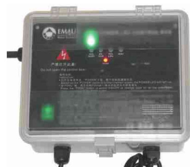
Underwater Light Control Box